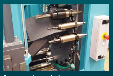
Automatic tool change